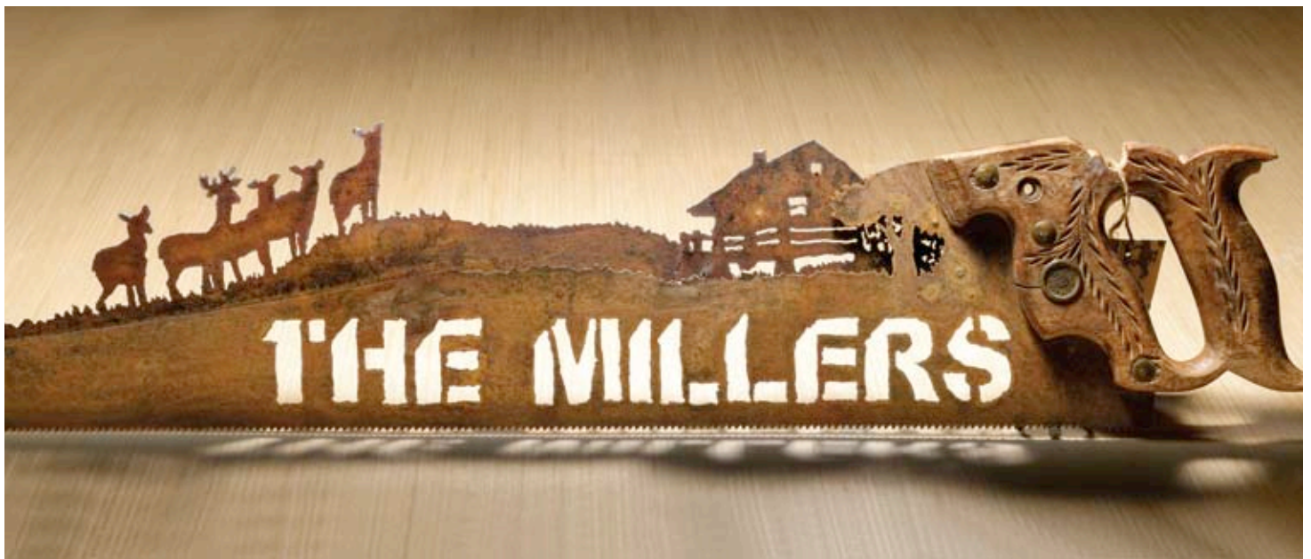
A cabin in the woods, with deer for visitors. What a scene!