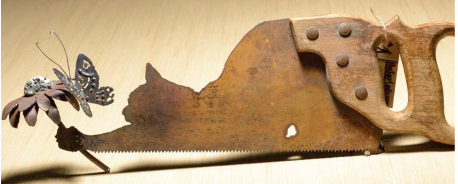
Hard to imagine this is actually a saw, isn't it? The cat holding onto the stem of a flower as a butterfly sits on its petals. What happens next is anybody's guess.