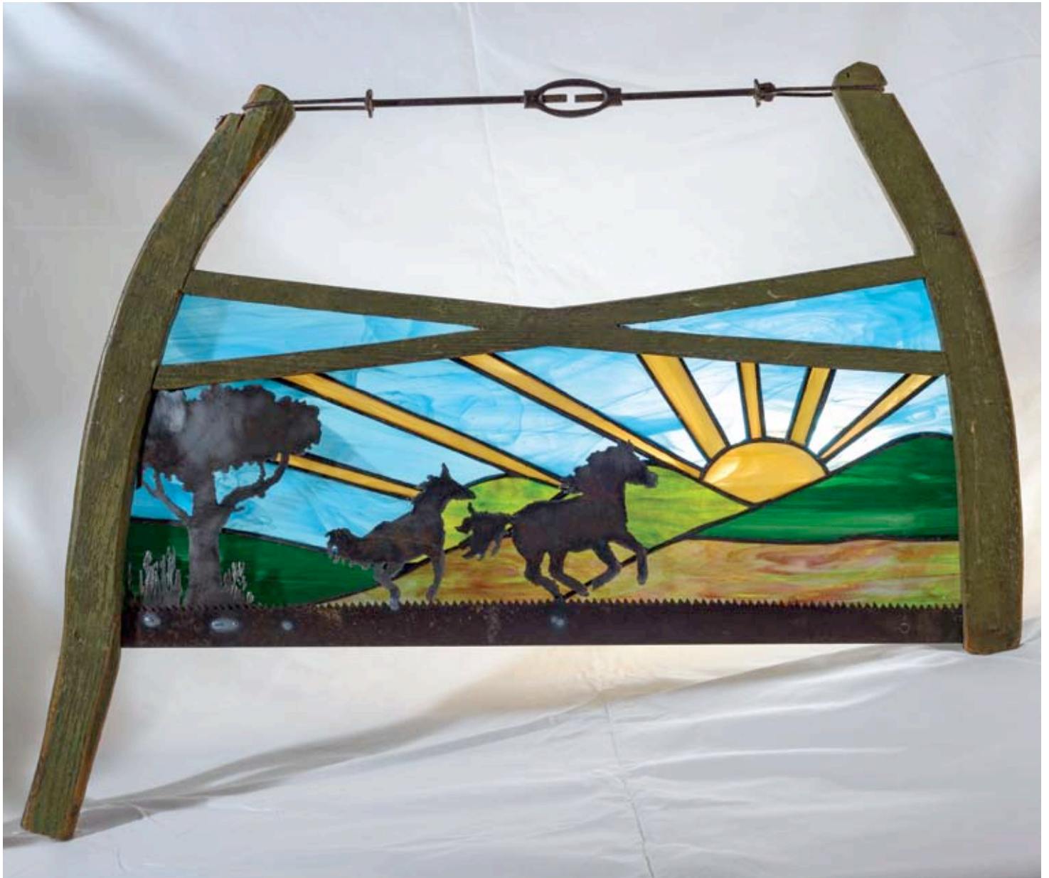
Every custom piece that is commissioned is complicated owing to the many layers and patinas.