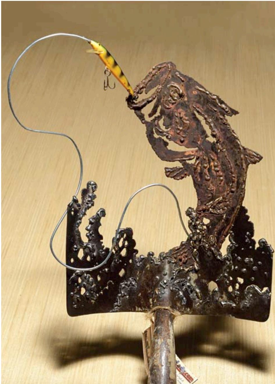
Made from a shovel head, the scene depicts how a fish is all set to take the bait!

When she chanced upon a shovel that had been cut to look like lace, inspiration hit her. "The first thing I cut out was the shape of a tree on a shovel that I had. It was rounded and I thought that it already looked like the top of a tree," she says. Post this she bought a stack of old and inexpensive saws at a yard sale.